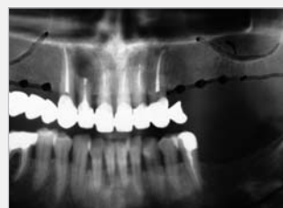
1. Panorami x-ray at patient presentation