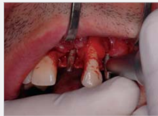
3. Periosteal measurements after insertion