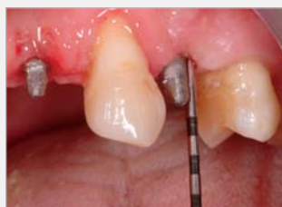
7. Probing depth before cementing final restoration implant 24

*All patients presented a fixed healed gingiva around the implants