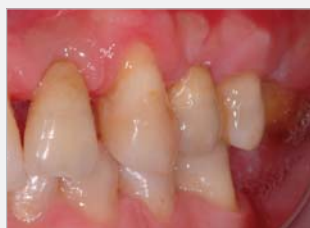
8. Final restoration in place