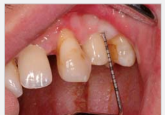
6b. Probing depth after 3 months with provisional restoration in place implant 22