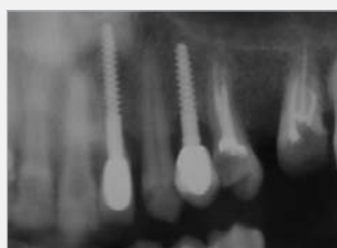
10. One piece (UNO) in Panoramic X-ray