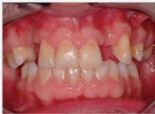
1. Oral status at first visit