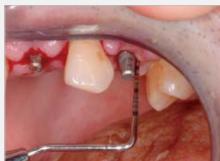
5b. Probing depth after suture removal for implant 24