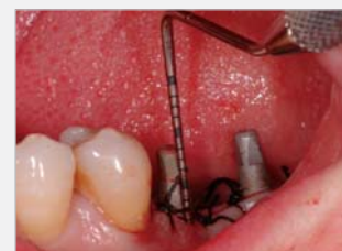
2. Probing depth after suturing implant 37