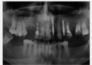
4. Panoramic X-ray after insertion