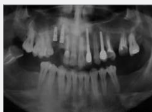
9. Panoramic X-ray after final restoration setting