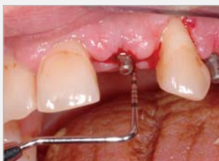
5. Probing depth after suture removal for implant 22