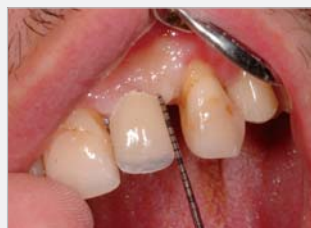
6. Probing depth after 3 months with provisional restoration in place implant 22